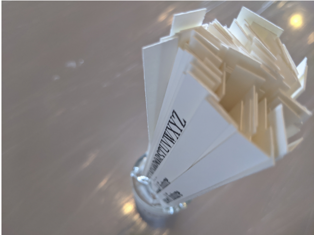
In the exhibition Droomfactor XL, Kunsthal 45, Den Helder

Copyright © 2021 The Snifferoo, All rights reserved. You are receiving this email because you showed interest in our products.