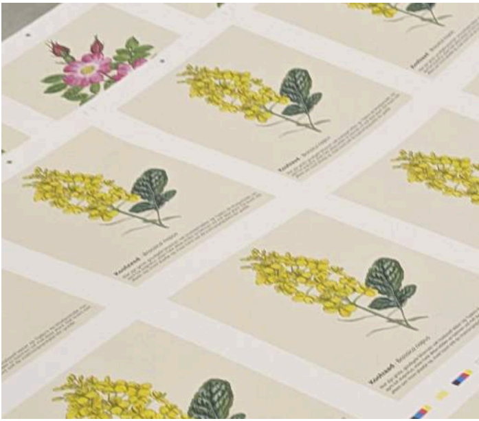
9 million scratch and sniff cards for the Postcode Lottery: Rose, Rapeseed and Honeysuckle