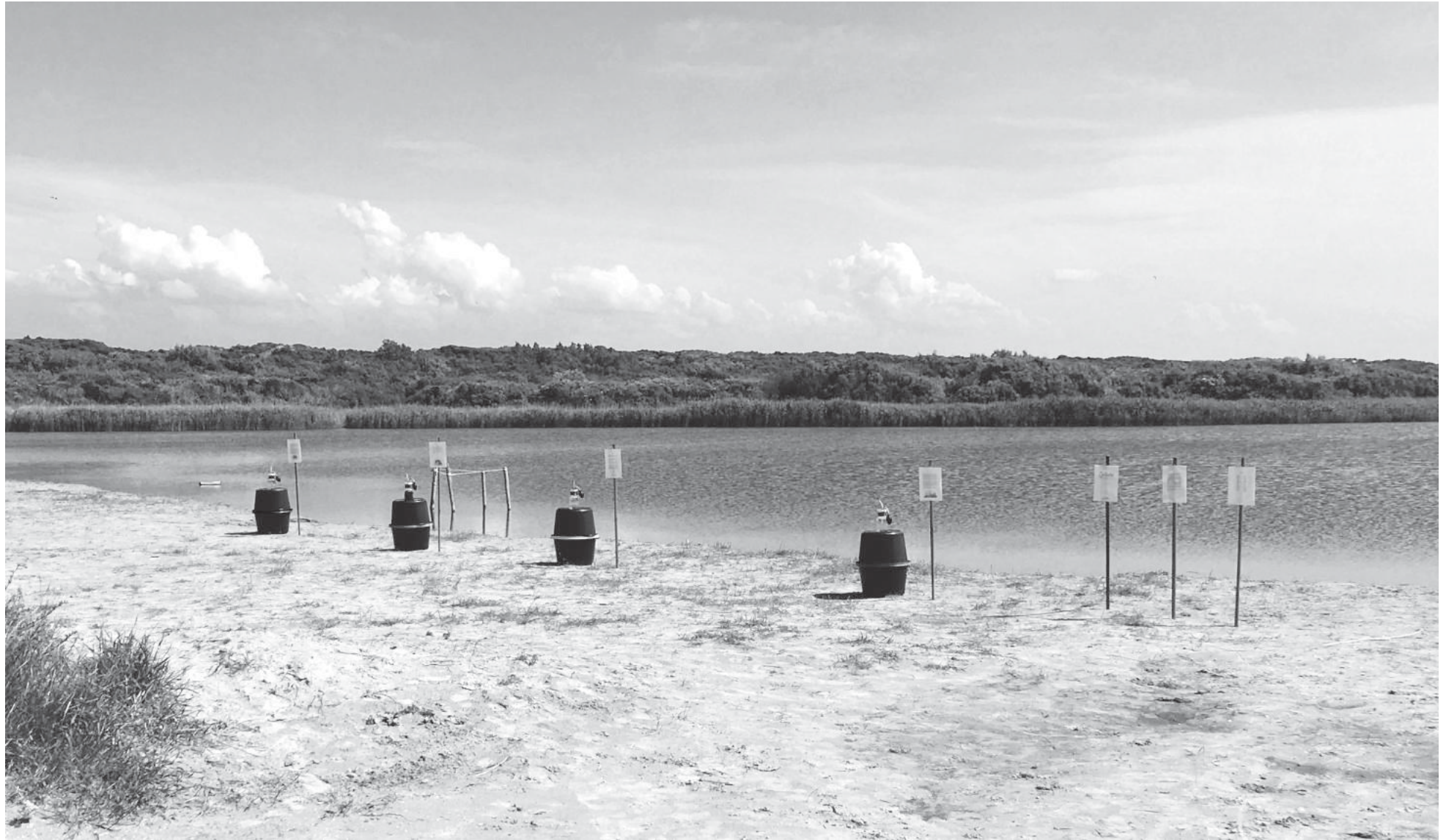
Scent exhibitions for The Ambassey of the North Sea